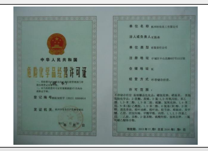
Dangerous Chemical Product License (Duplicate)