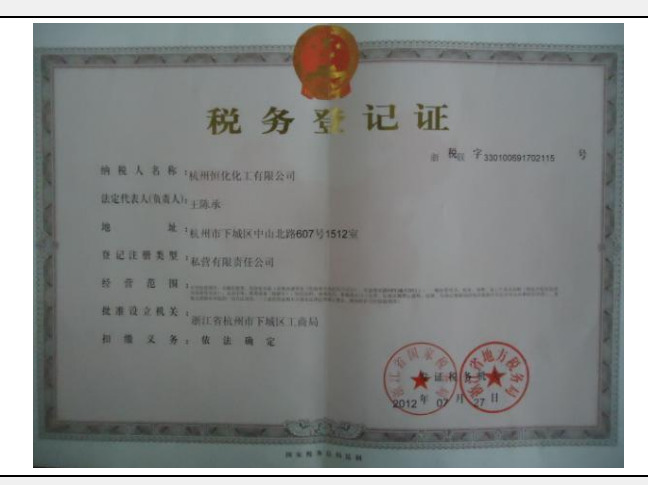
Import and Export Enterprise Registration